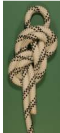
Figure of Eight Knot tied on a Bight Figure A.2