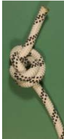
Double Overhand Knot