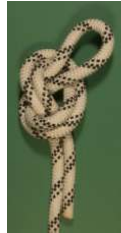
Overhand Knot tied on a Bight