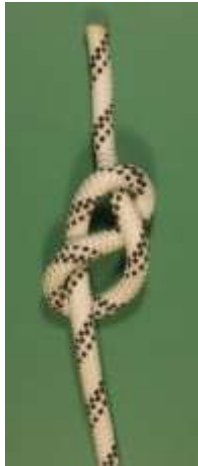
Figure of Eight Knot Figure A.1

A (single) Figure of Eight Knot is shown in Figure A.1 and a Figure of Eight Knot tied on a Bight is shown in Figure A.2. This translation adopts the convention of using the term "Figure of Eight Knot" to mean a Figure of Eight Knot tied on a Bight.