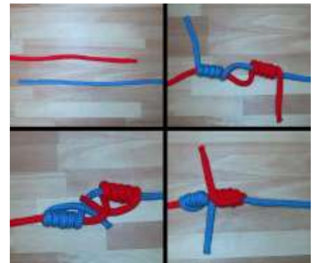
Barrel or Blood Knot Figure C.3 16