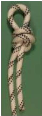
Barrel Knot Figure C.1

The name Barrel Knot was given in an English publication 14 in 2001, see Figure C.1, to the knot shown on page 8, see Figure C.2. The description of a Barrel Knot 15 however, is one which applies to a number of turns, perhaps as many as 8 and is used to join two lengths of line, see Figure C.3. Variations in usage of the Barrel Knot within a Cow's Tail in the United Kingdom include using three turns. This translation adopts the convention of using the term "Barrel Knot" in place of the French name "Half a Double Fisherman's Knot" [Demi pêcheur double].